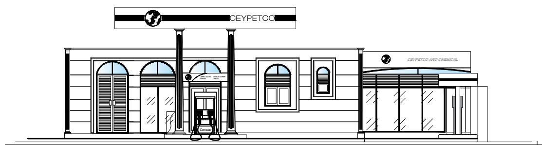
FRONT ELEVATION SCALE: 1:100